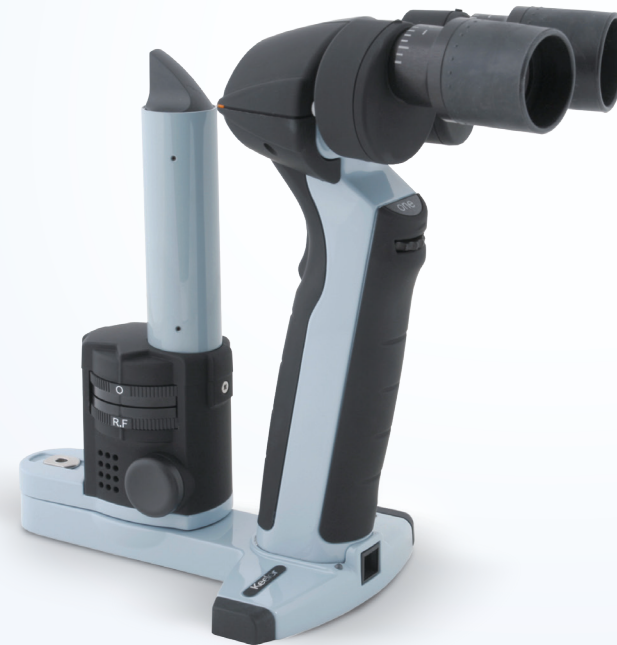
The PSL one 10x magnification