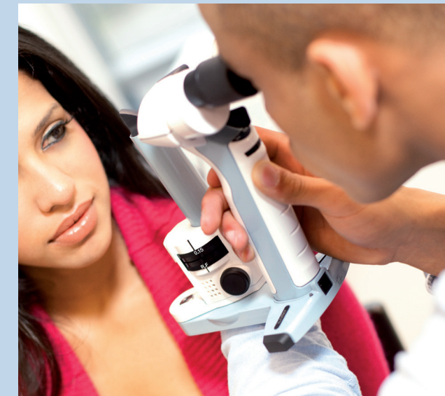
Versatility and portability are key benefits of the Keeler PSL Slit Lamps

Classification: CE Regulation 93/42 EEC: Class I FDA: Class II Production processes, testing, start-up, maintenance, and repairs are conducted in strict conformity with the applicable laws and international reference standards.