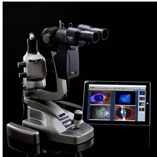
Keeler Connect™ Software

Imaging software provides a whole new dimension to eye exams, both for you and your patients. The ability to capture images and videos enables instant exam review and the potential to offer additional services within your clinic. Efficiency and ease of use are crucial to keep up with high patient flow, therefore, Keeler has hand-picked software packages to allow users to get the most out of their Slit Lamp.