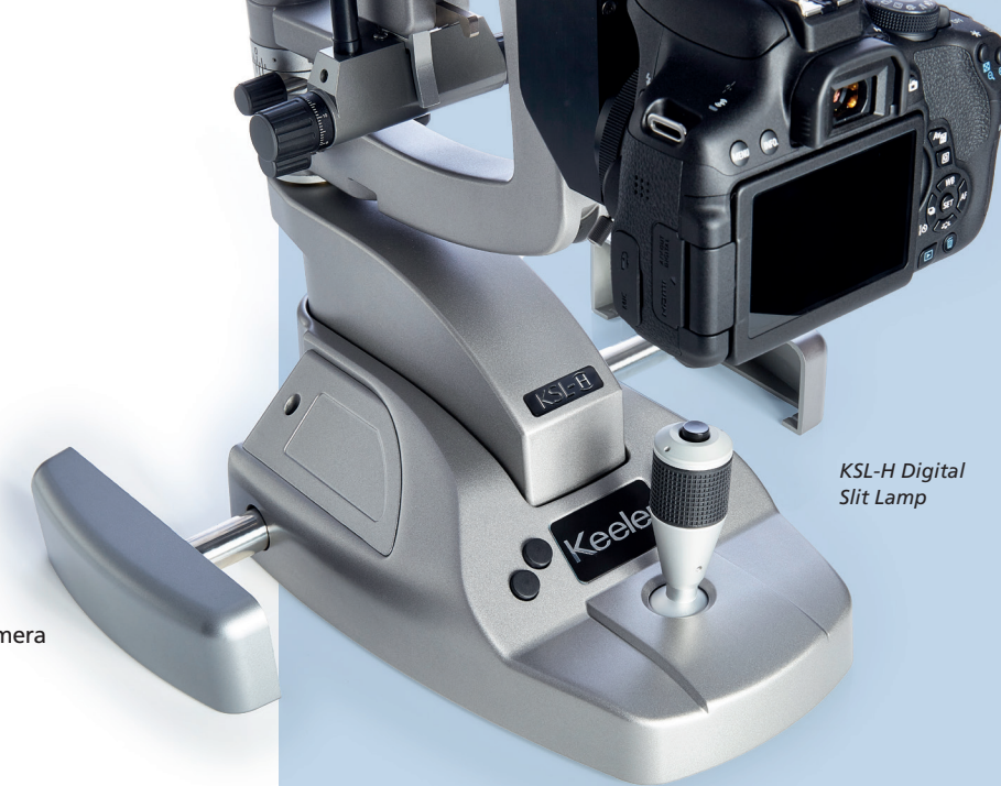
KSL-H Digital Slit Lamp