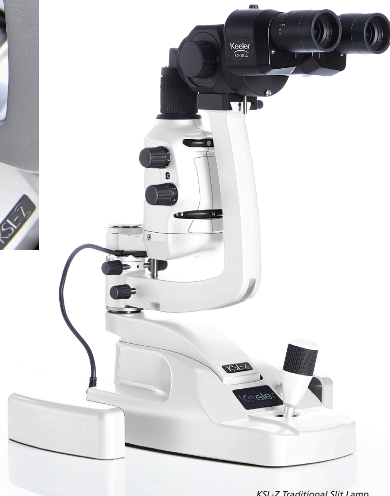
KSL-Z Traditional Slit Lamp