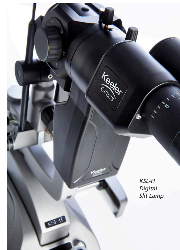
KSL-H Digital Slit Lamp

Available add-ons: digital camera, Kapture software