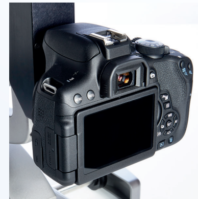
KSL-Z Digital Ready Slit Lamp with camera attachment

Lower Illumination 5 step magnification (6x, 10x, 16x, 25x, 40x) Digital Slit Lamp 3 megapixel: 2056 x 1542 USB 3 camera Kapture software