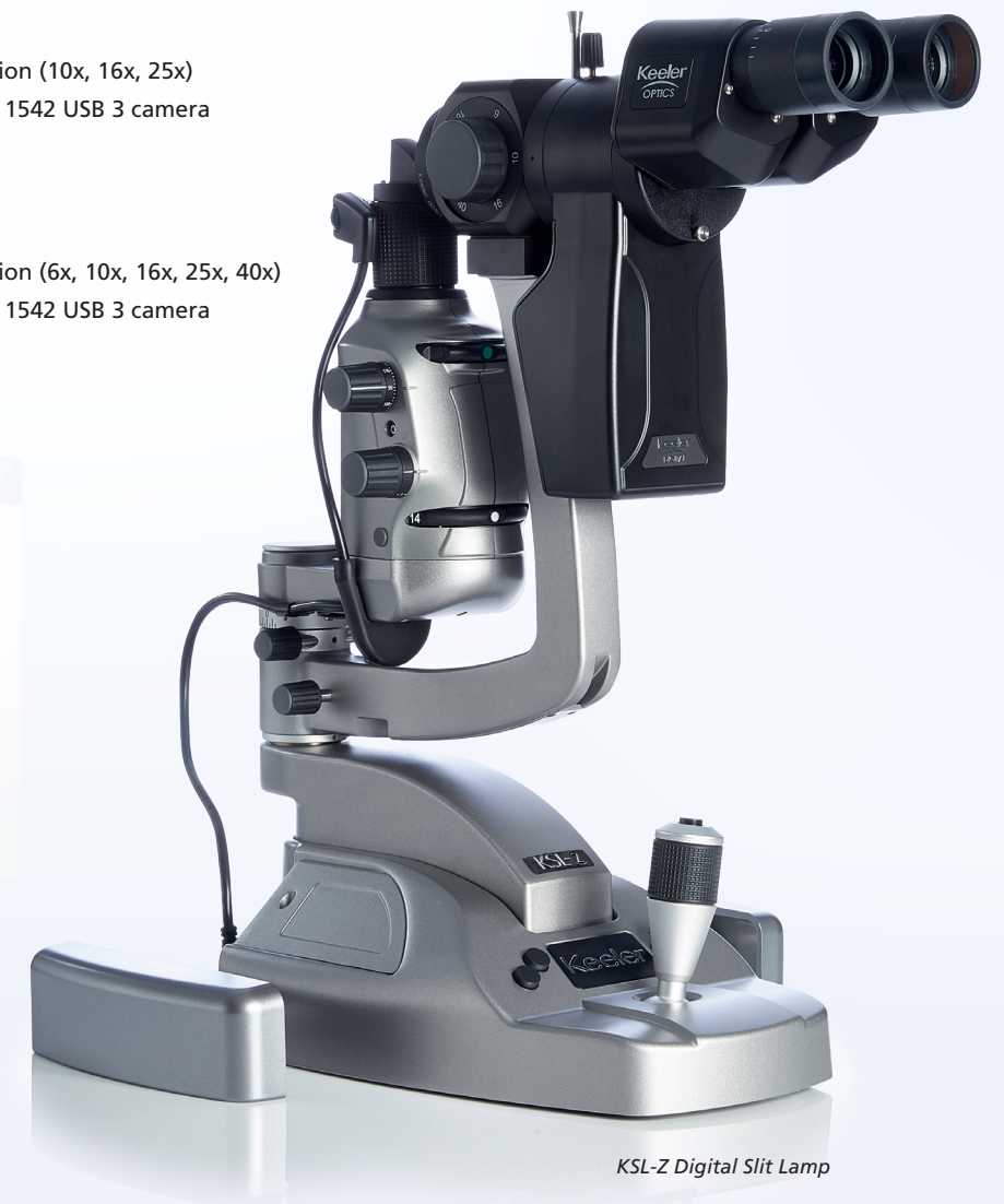
KSL-Z Digital Slit Lamp