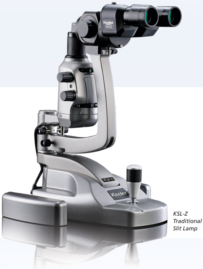
KSL-Z Traditional Slit Lamp

Available in Traditional, Digital and Digital Ready and with a 3 or 5 step magnification.