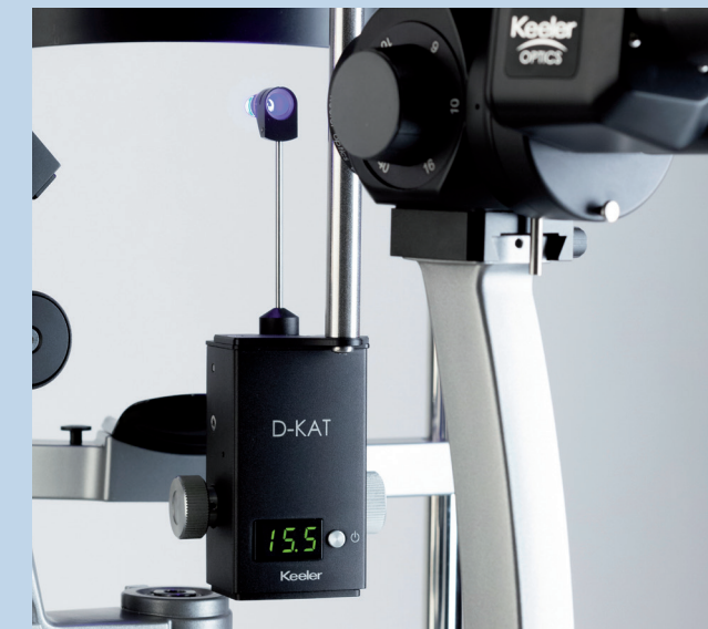
DKAT Digital Tonometer