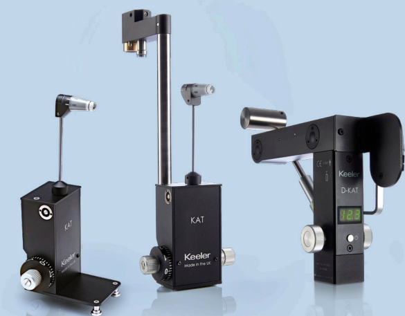
T Type KAT

THE Z TYPE is removable and mounted on the top of the drum of the KSL-Z Slit Lamp.