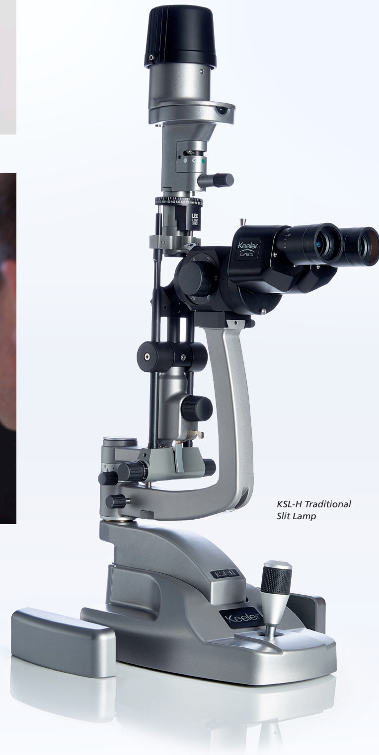
KSL-H Traditional Slit Lamp