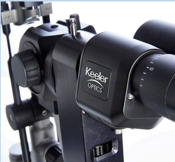
World Class Keeler Optics

Available in Traditional, Digital and Digital Ready and with a 3 or 5 step magnification.