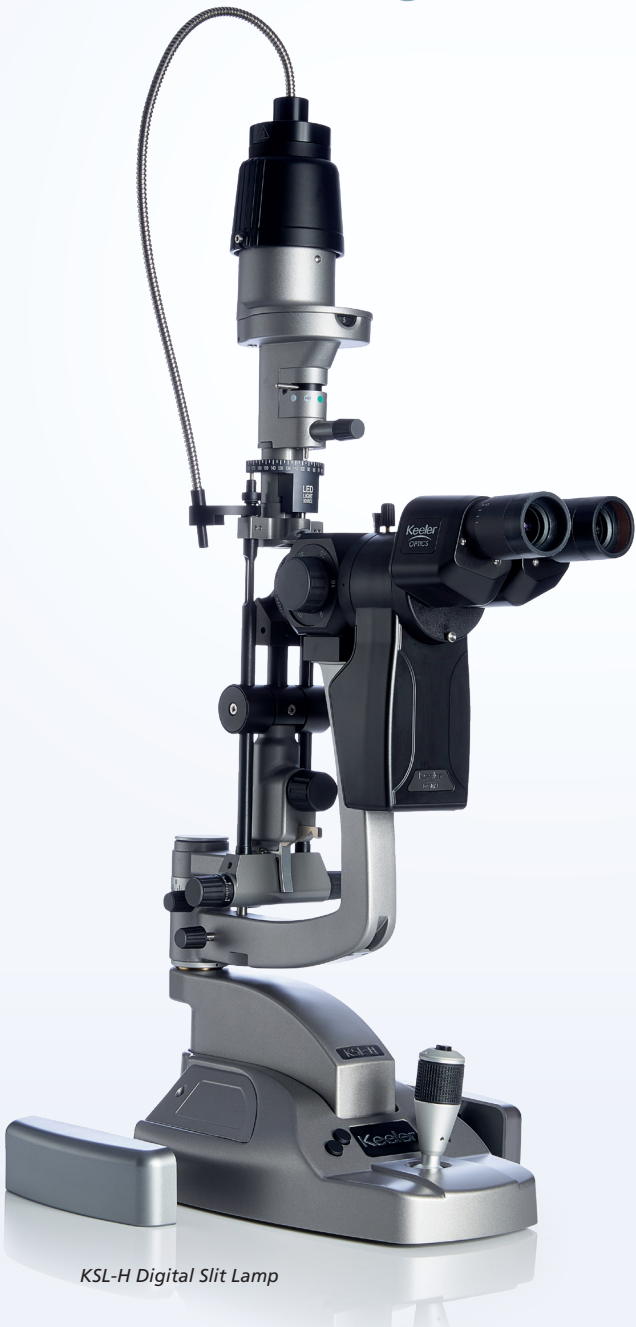
KSL-H Digital Slit Lamp